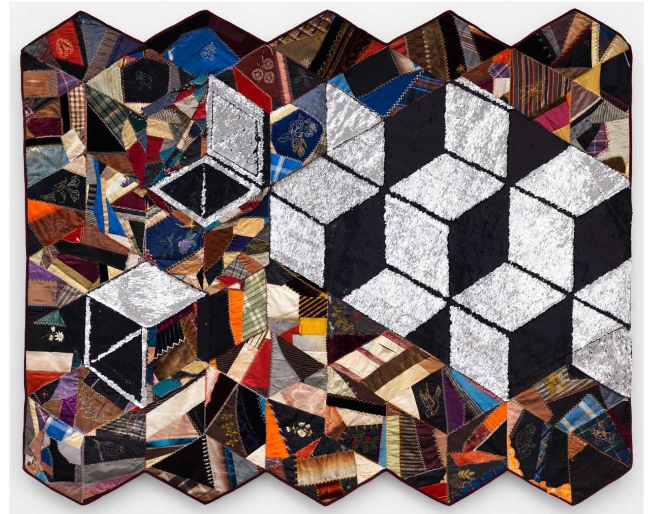
Ooo Oui , 2017. Antique quilt, assorted textiles, sequins.