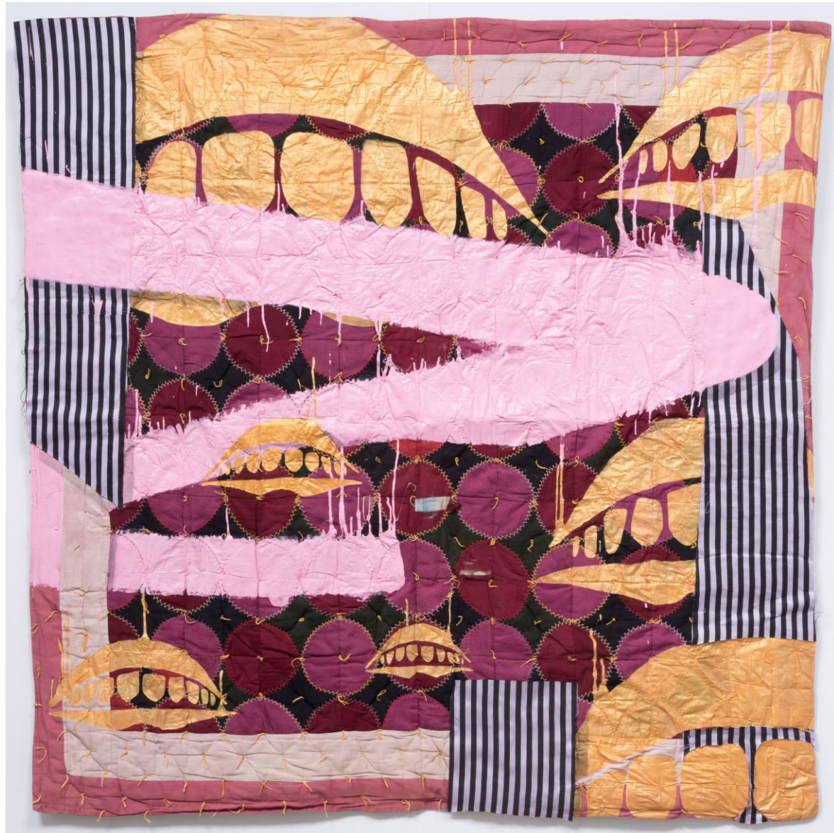
Grip & Grin , 2017. Antique quilt, various textiles, acrylic.