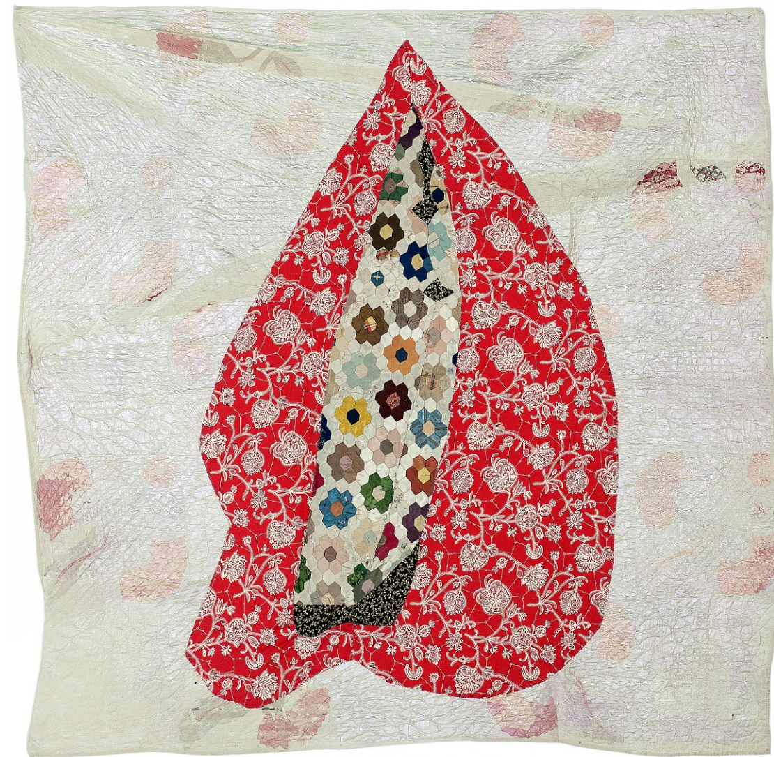
Cheshire (Guapa) , 2014. Antique quilt, assorted textiles, acrylic.