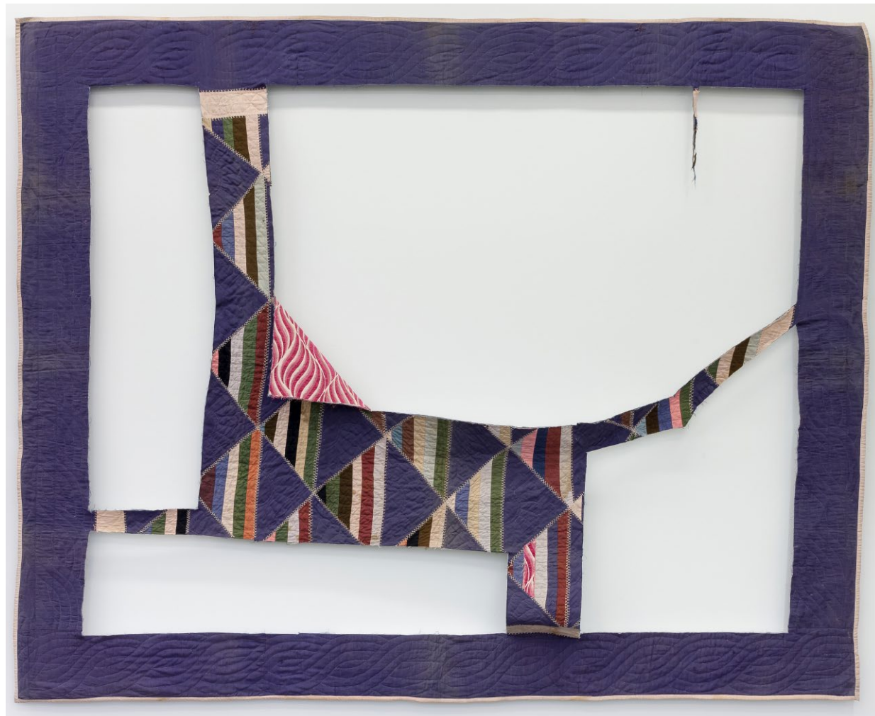
Lucretia , 2018. Antique quilt, assorted textiles.