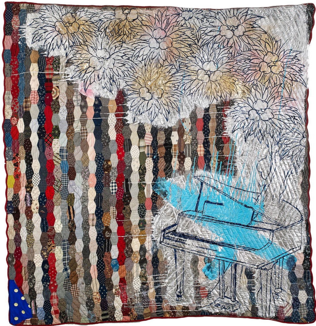
Blossom Study , 2014. Antique quilt, assorted textiles, acrylic, spray paint.