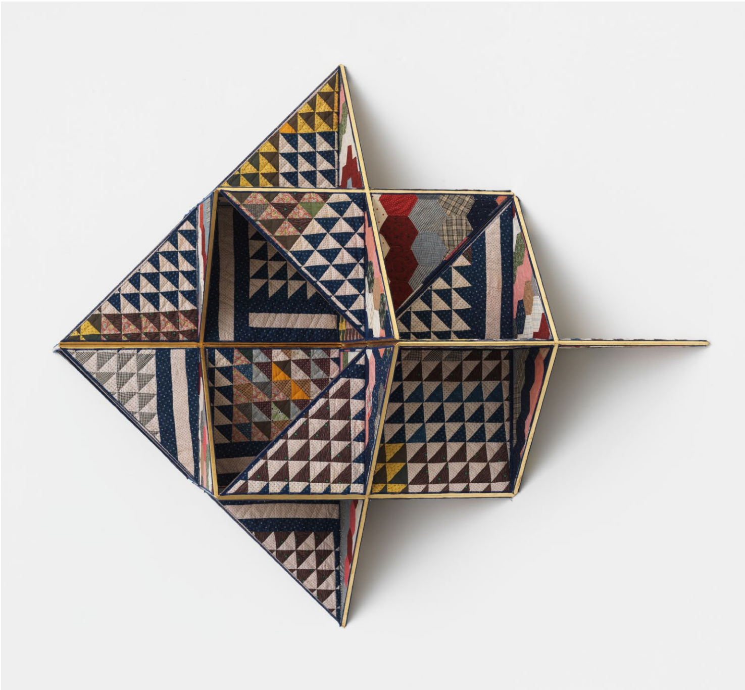
Khemetstry , 2017. Antique quilt, birch plywood, gold leaf.